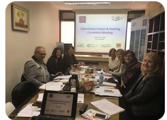
Sofia October 2018