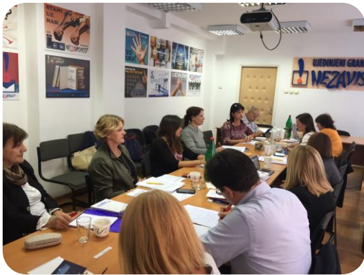
Belgrade September 2017