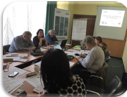
Bucharest February 2018