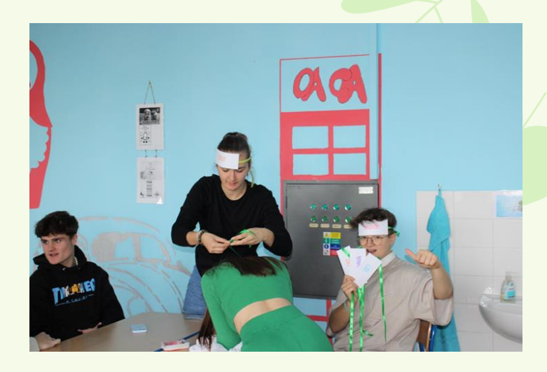
Train your brain - activities