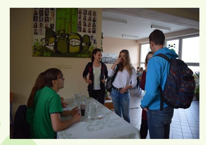
Water tasting - trash games