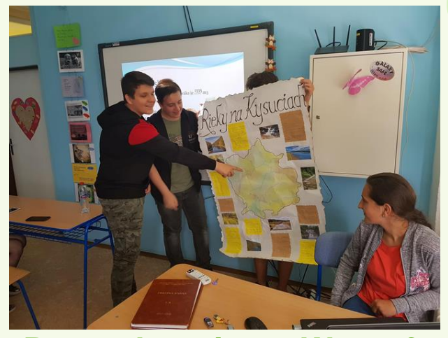
Peer education – Water footprint